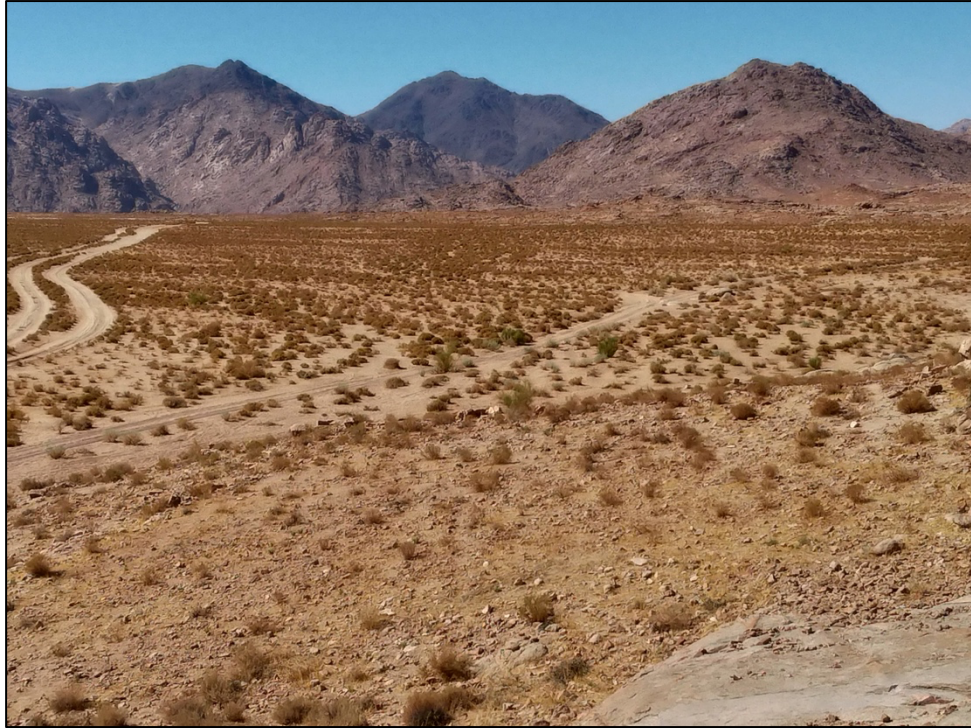
Possible Sinai campground in Midian, site of the first tabernacle