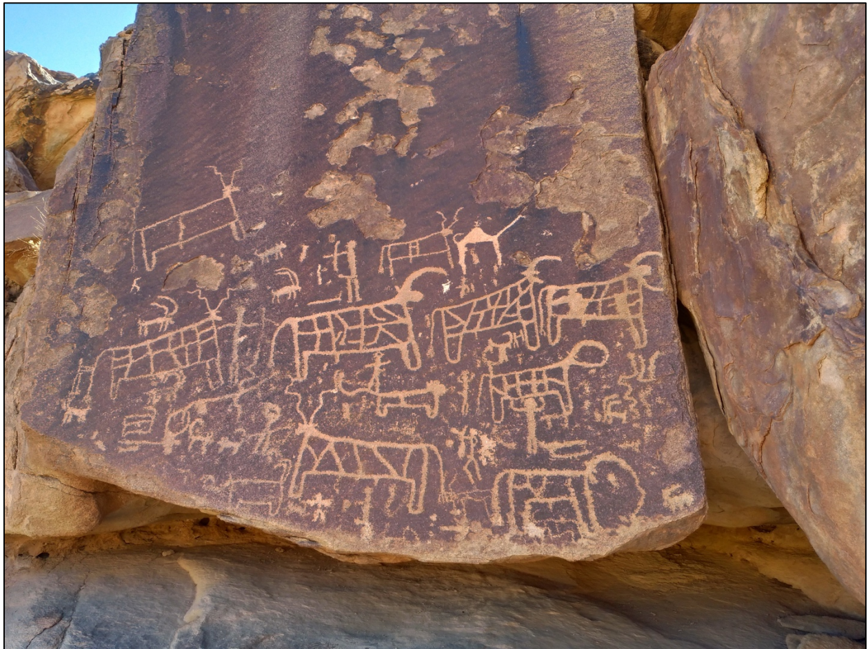
Cow worship at the base of Mount Sinai, Saudi Arabia

In Midian, God judged the Hebrews for the worship of a golden calf. They could literally see God’s glory on the mountaintop yet they worshiped a man-made young bull. The Apostle Paul says in 1 Corinthians 10:8 that 23,000 Hebrews died that day because of false worship.