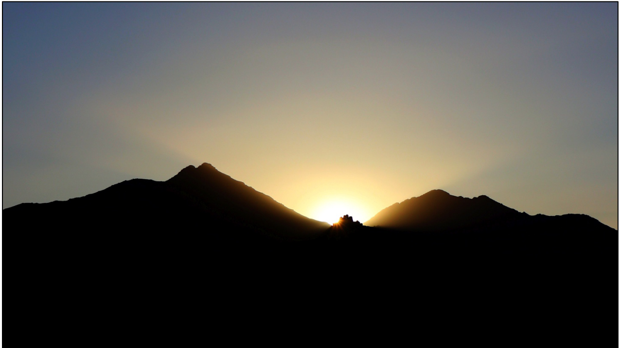
Sunset over Mount Sinai in Saudi Arabia

When God met Moses in the burning bush he said, “When you have brought the people out of Egypt, you shall serve God on this mountain” (Exodus 3:12). And so, after the Lord delivered the people of Israel from the Egyptians, they traveled to the “mountain of God” in Midian where God had first revealed Himself to Moses (Exodus 18:5, 24:13).