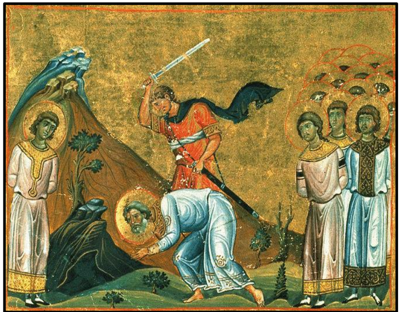
Orthodox iconography of the martyrdom of St. Arethas

Thousands of believers who refused to deny Christ were subject to torture by their Jewish persecutors, some one hundred years before the rise of Islam. The leader of the Christian community of Najran at the time, Harith (Arethas), was a beloved and respected elder. The