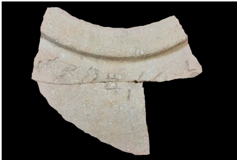
Pottery shard written in the Sabaean language that dates to the time of King Solomon and the Queen of Sheba, found in Jerusalem.

Although some scholars suppose that the Queen of Sheba is from Ethiopia, there is a strong basis for locating Sheba in Southern Arabia. The remains of the palace of the Queen of Sheba may be at an archaeological site in Marib, Yemen. One of the best-preserved buildings in the ruins, the Bar'an Temple (also known as the Throne of Bilqis), may be the ancient palace. Sumharam at Khor Ruri in southern Oman, now a UNESCO World Heritage Site, is supposedly the summer palace of the Queen of Sheba. It is possible that Yemen, Eritrea, and Ethiopia at one time may have been joined by one ruling power or kingdom; therefore, the kingdom of Sheba may have spanned the Red Sea. Nonetheless, the oldest writings of Sabaean [Sheba] language on rocks comes from Yemen, not Ethiopia. The Sheba of Isaiah also seems linked closely with Oman, Yemen, and Saudi because the other four nations from Isaiah 60 are in the Arabian Peninsula.