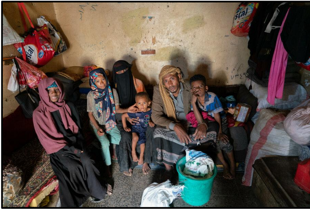
A typical Yemeni family struggling to survive.