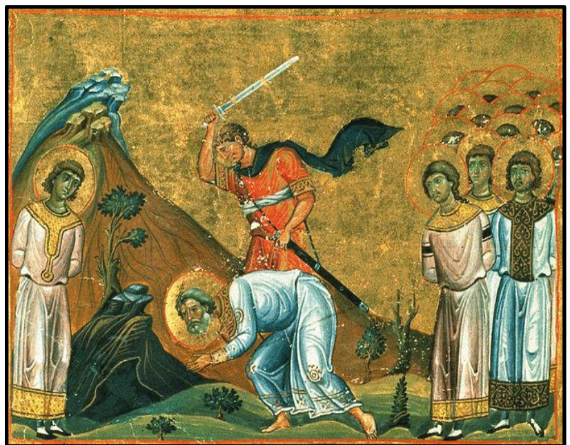
Orthodox iconography of the martyrdom of St. Arethas

Thousands of believers who refused to deny Christ were subject to torture by their Jewish persecutors, some one hundred years before the rise of Islam. The leader of the Christian community of Najran at the time, Harith (Arethas), was a beloved and respected elder. The devastating