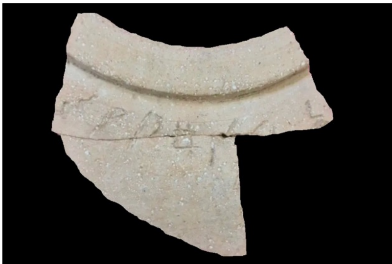
Pottery shard written in the Sabaean language that dates to the time of King Solomon and the Queen of Sheba, found in

Although some scholars suppose that the Queen of Sheba is from Ethiopia, there is a strong basis for locating Sheba in Southern Arabia. The remains of the palace of the Queen of Sheba may be at an archaeological site in Marib, Yemen. One of the best-preserved buildings in the ruins, the Bar'an Temple (also known as the Throne of Bilqis), may be the ancient palace. Sumharam at Khor Ruri in southern Oman, now a UNESCO World Heritage Site, is supposedly the summer palace of the Queen of Sheba. It is possible that Yemen, Eritrea, and Ethiopia at one time may have been joined by one ruling power or kingdom; therefore, the kingdom of Sheba may have spanned the Red Sea. Nonetheless, the oldest writings of Sabaean [Sheba] language on rocks comes from Yemen, not Ethiopia. The Sheba of Isaiah also seems linked closely with Oman, Yemen, and Saudi because the other four nations from Isaiah 60 are in the Arabian Peninsula.